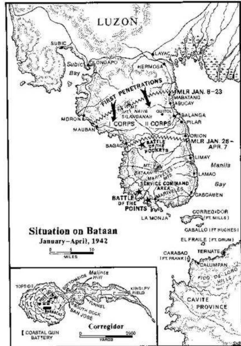
Figure 1.1: Map of Bataan Showing Situation During World War 2