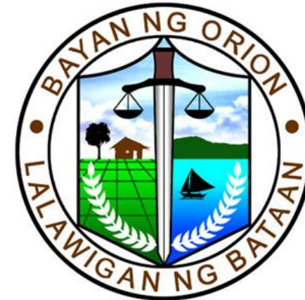
Figure 1.5: Official Seal of Orion

The official seal of Orion is divided into two halves, representing the two most prominent industries in Orion. On the left half is an image of a farmland, which represents the agriculture industry in Orion. On the right half is an image of boat in the middle of the sea, which represents the fishing industry in Orion. In the background of the image of the sea is a mountain range, representing the mountainous western part of the municipality. Dividing these two halves is an image of a sword with scales, which represents Don Cayetano Arellano, the first Filipino Chief Justice of the Supreme Court and Orion's most famous son.