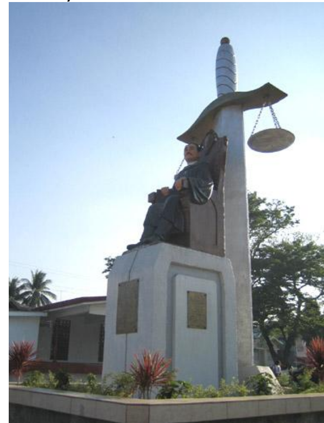
Figure 1.3: Don Cayetano Arellano Marker in front of the Municipio

Established in 1938, the Arellano Law School located in Pasay City, Metro Manila, was so founded in honor of him. A barangay in Orion was also named after him. A marker in front of the Municipio stands in his remembrance.