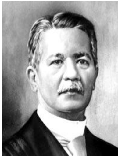
Figure 1.2: Don Cayetano Arellano (1847-2000)